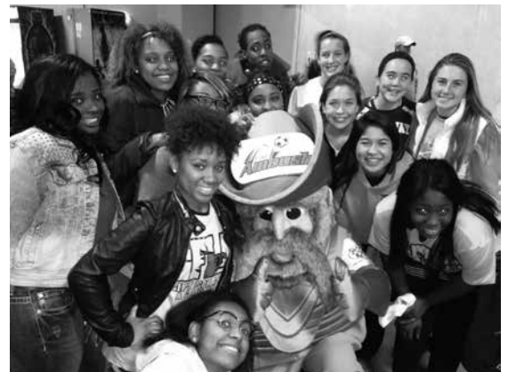
Student athletes from LFLA and Parkway North High School spend some time with Bushwhacker, the mascot of the St. Louis Ambush indoor soccer team.

Girls soccer practice will begin in March and games will be played in April.